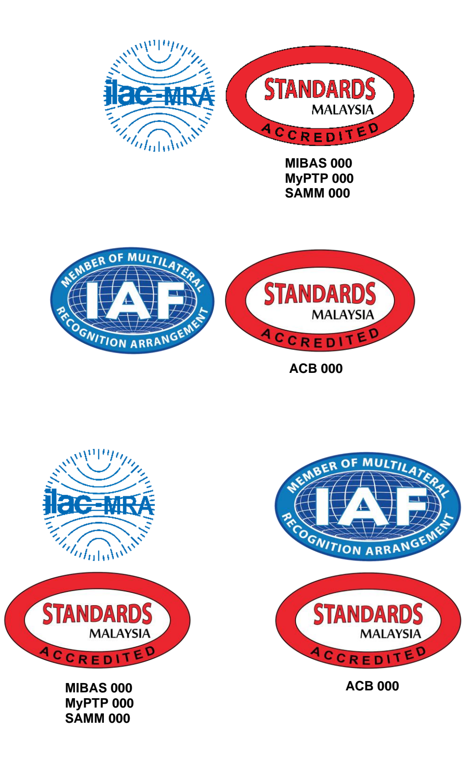
Figure 7: An example Combined ILAC MRA / IAF MLA Mark for CAB (multiple schemes and programmes)