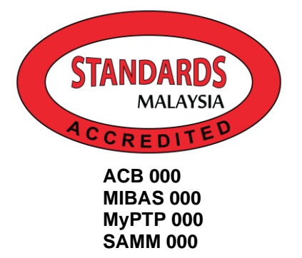
Figure 4: An example of accreditation symbol for CAB (multiple schemes)

Note: An organisation having several accredited CABs may choose to display the accreditation symbol accompanied by one or more of the appropriate accreditation numbers according to accreditation schemes and alphabetical order.